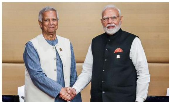
Prime Minister Narendra Modi meets Bangladesh Chief Advisor Muhammad Yunus, in Bangkok on Friday.

While both leaders raised contentious issues – including India's call for the protection of minorities in Bangladesh, Dhaka's demand for the extradition of former Bangladesh PM Sheikh Hasina, and border security issues – during the meeting, they met on cordial terms and exchanged commitments to bilateral ties. Bangladesh will host the BIMSTEC summit next year, and Mr. Modi congratulated Mr. Yu-