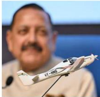
Union Minister Jitendra Singh during the announcement of ToT partner for HANSA-3 (NG).

The HANSA-3 NG aircraft is a two-seater aircraft and is the latest iteration of the HANSA planes that have been made by NAL since 1998. Fourteen HAN-