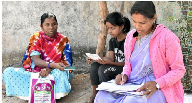
Difficult task: A teacher collecting details from a woman as part of the caste Census at Kandi in Sangareddy, Telangana on November 18, 2018.

Challenges to access accurate data Upward caste mobility claim – the reporting of one's caste by respondents can be influenced by the perceived prestige associated with certain social groups and their position within the varna hierarchy. This is evident from changes in caste claims between the 1921 and 1931 Censuses, where some communities that initially reported belonging to lower positions within the varna system in 1921 later reported themselves as belonging to higher categories in 1931 (see Table 1). Another notable observation from these claims is that different members of the same